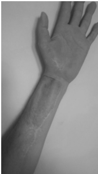
Figure 2. Graft scar tissue on left wrist of the patient.

In the report, which was prepared by the university hospital on the collision day it was stated that he applied emergency due to vehicle accident. Our case had a surgery for right temporal bone fracture at the same day. He had damaged tendons of second and third fingers and second finger bone fracture in the left hand. Facial nerve and tissues on the right side of his face and dura mater were defected.