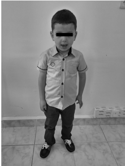
Figure 4. Hemiparesis of the right side of the patient's body

In the report, which was prepared by a training and research hospital on the collision day it was stated that he applied emergency due to vehicle accident. He had a cranial bone fracture with hematoma and stayed hospital for rehabilitation program.